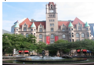
Landmark Center, St. Paul, MN

Watch for the upcoming emails on the new conference plan.